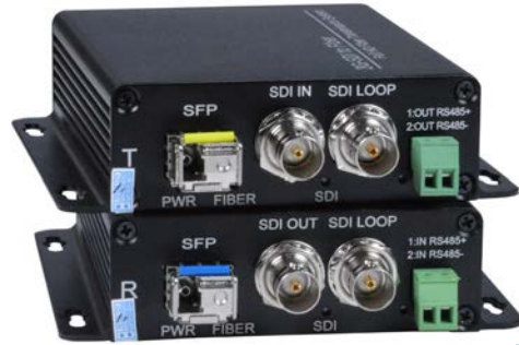
XTENDEX® ST-1F03GSDI-LC (Local and Remote Unit)