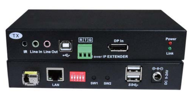
ST-C6FOUSBDP4K-LC (Local and Remote Units)