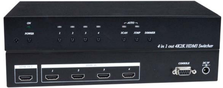
VIDMUX® SE-4K18GB-4RS (Front & Back)