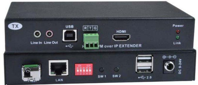
ST-C6FOUSB4K-LC (Local and Remote Units)