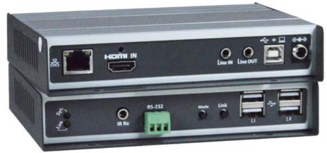
XTENDEX® ST-IPUSB4K-VW (Local & Remote Unit)