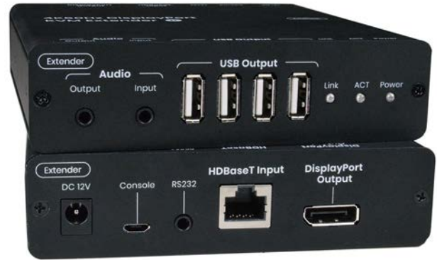
ST-C6USBDP4K21GB-328 (Remote Unit - Front & Back)