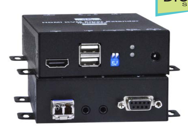
ST-FOUSB4K18GB-LC (Remote and Local Units)