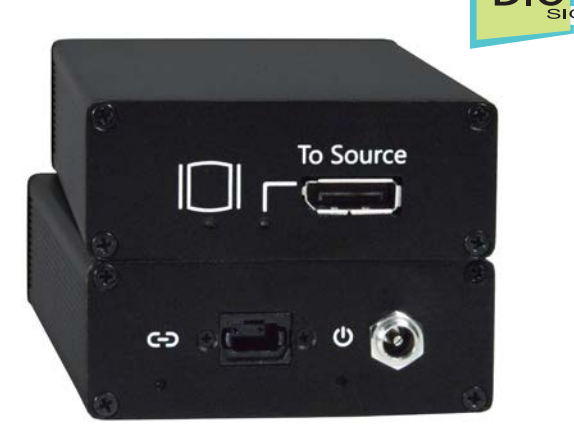
ST-FODP14-MPO (Remote and Local Units)