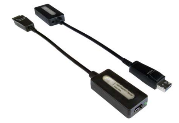
XTENDEX® ST-FODP14-MPO-200M (Local & Remote Unit)

The XTENDEX® 8K DisplayPort 1.4 Extender via MPO Fiber Optic Cable locates an Ultra-HD 8K 4320p 60Hz DisplayPort display away from a DP computer up to 656 feet (200 meters) via a male-to-male multimode OM3 type B MPO fiber optic cable (8- or 12-strand). Each extender consists of a transmitter that connects to a DisplayPort source, and a receiver that connects to a DisplayPort display.