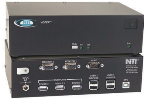
VOPEX-USBV-2 (Front & Back)

The VOPEX® VGA USB KVM Splitter with built-in USB hub allows two users (two USB keyboards, mice and VGA monitors) to access one USB computer (PC, SUN, MAC) and up to three USB devices (printers, scanners, security cameras, etc).