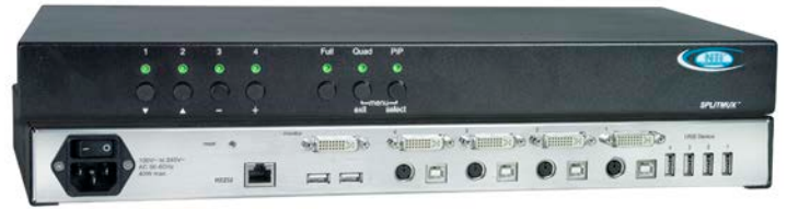
SPLITMUX-DVI-4-CLR (Front & Back)

The SPLITMUX® DVI/VGA Quad Screen Multiviewer allows you to simultaneously display video from four different computers on a single monitor. Additionally, it can switch one of the four attached computers to a shared keyboard and mouse for operation and to four additional USB devices.