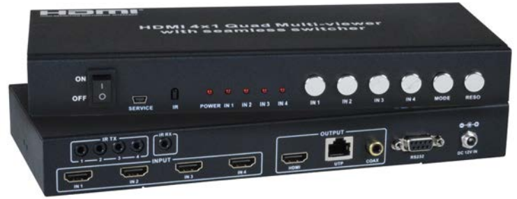
SPLITMUX-C5HDR-4LC (Front & Back)