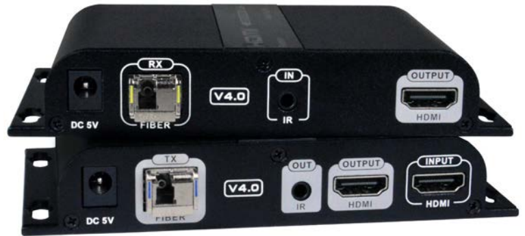
XTENDEX® ST-IPFOHD-LC-ULC (Remote & Local Unit)