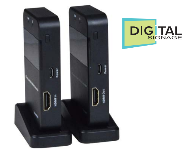
ST-WLHD-98 (Local and Remote Unit)