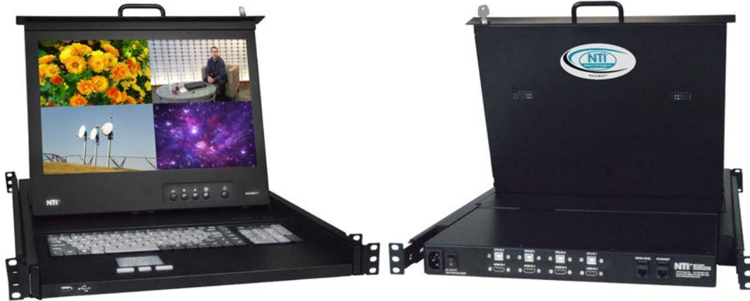
RACKMUX-D17HR-N-SUSBHD4 (Front & Back)

Display video from four HDMI/DVI computers simultaneously on a 1RU DVI LCD KVM drawer. Switch to and control any of the four computers while monitoring the other three connections in real time.