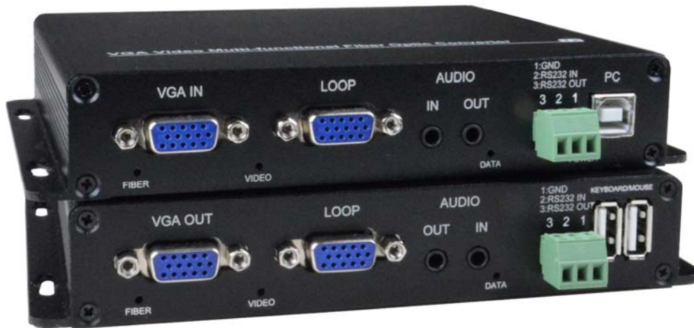
ST-FOUSBVARS-LC12V Local and Remote Unit (Rear View)