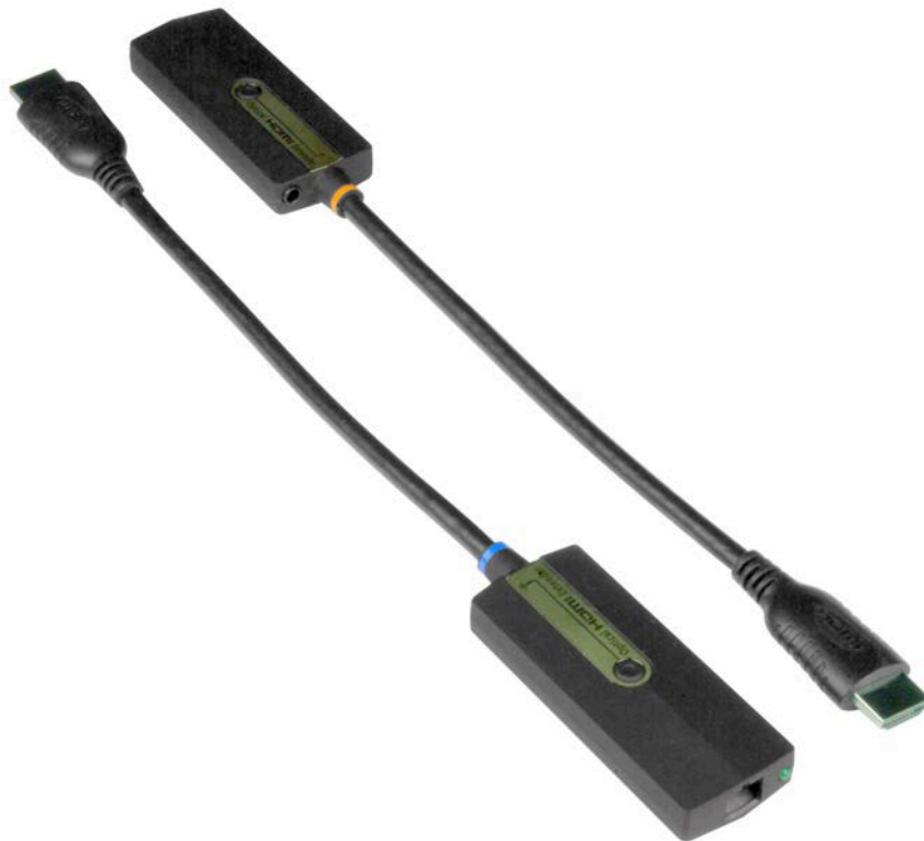
ST-FOHD-SC50 Transmitter and Receiver