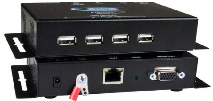
ST-C5USBVT (Remote Unit, Front and Back)

The XTENDEX® Transparent VGA USB Extender extends four USB devices and a VGA monitor up to 200 feet. Each USB extender consists of a local unit that connects to a computer and also supplies video to a local monitor, and a remote unit that connects to four USB devices and a monitor.