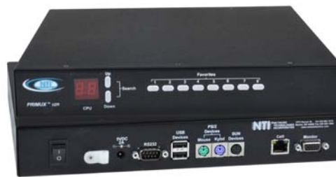
PRIMUMX-UZR (Front & Back)