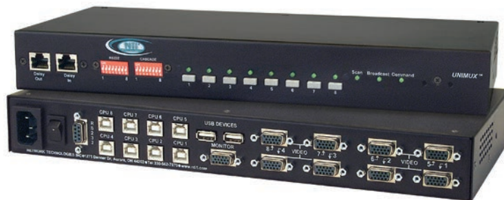
UNIMUX-USBV-80-RS (Front & Back)