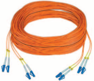
Compatible Fiber Optic Cable FIBER-D-LCLC-50-xxM