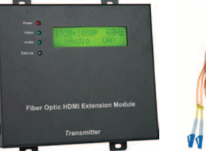
ST-FOHD-LC Transmitter Unit