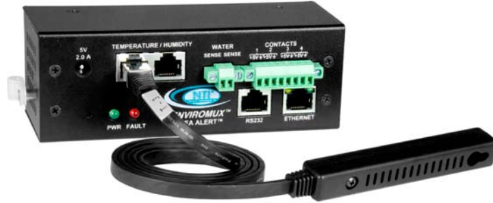
ENVIROMUX-MINI with ENVIROMUX-T-3 Temperature Sensor