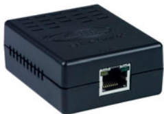
ENVIROMUX-STX ENVIROMUX-STHSB ENVIROMUX-STHS-99